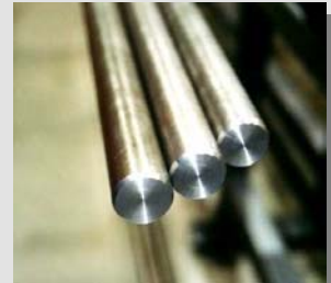
Finished bars on ramp

This machine will chamfer & face both ends of steel bars. It will run 9-17' long bars and the bars can vary +/- 2" within a particular size. The diameter range is from 1/4" to 2.0".